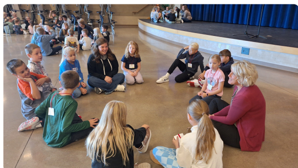
Small Groups getting to know each other.