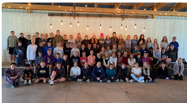
Middle School students at Retreat at Lonestar.