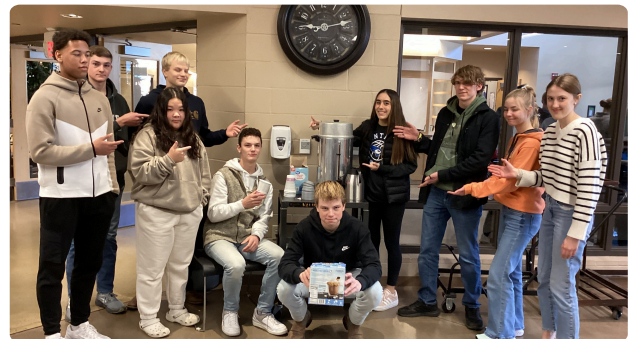
High School students on a scavenger hunt.