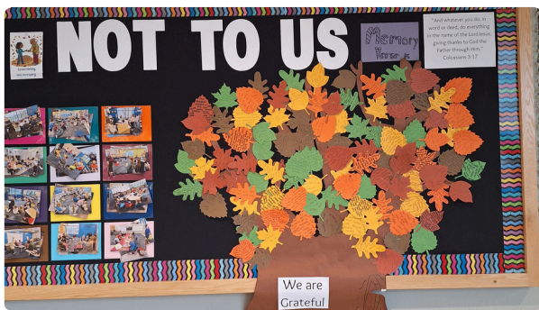
The Grateful Tree on the elementary storyboard.