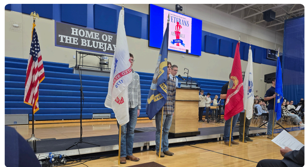
The flag salute at the Veterans Day assembly.