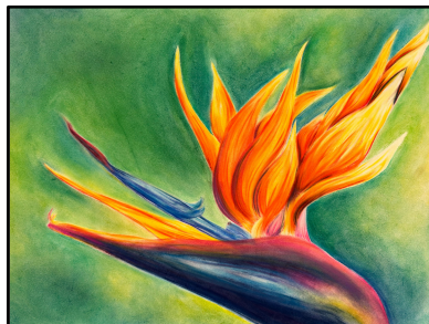
Maggie Setrum, 10th