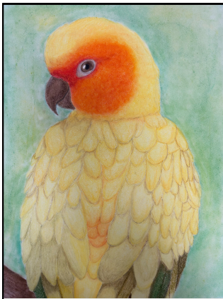
Brooke Schlegel, 10th