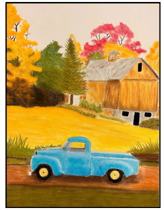
Isaac Asche, 11th