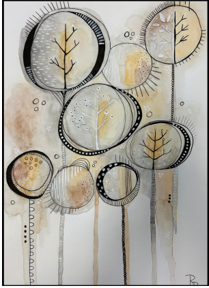
Reece Duininck, 10th